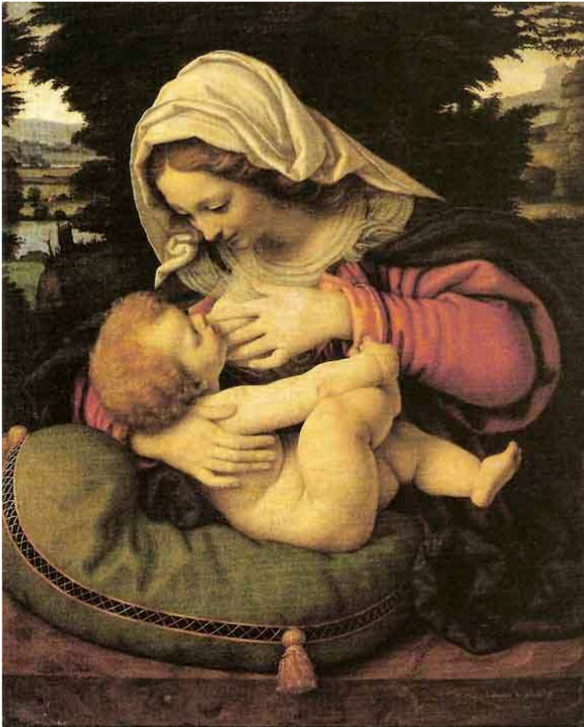
La Vierge au coussin vert – Andrea Solario. National Museum (Paris)