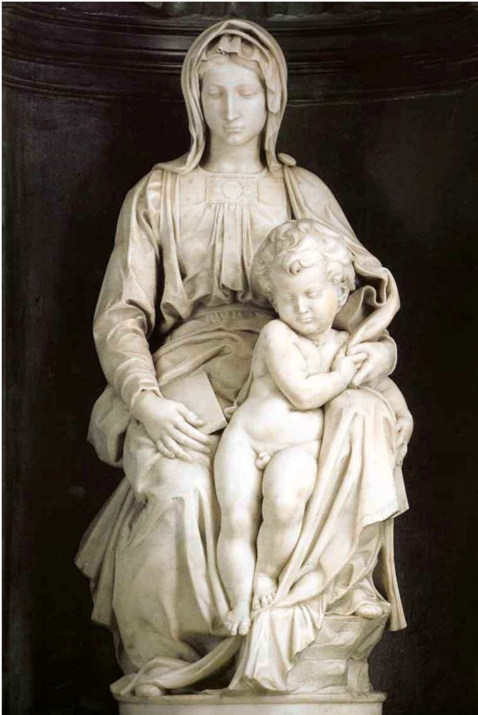
Madonna and Child – Michaelangelo. Welcome Church of Our Lady (Bruges)