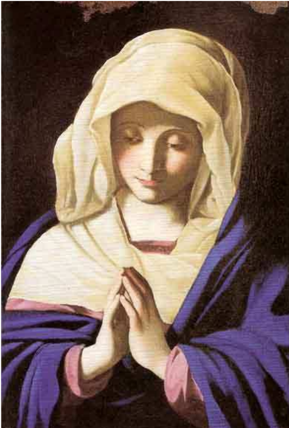
Madonna – G. B. Salvi da Sassoferrato. Basilica San Clemente (Roma)