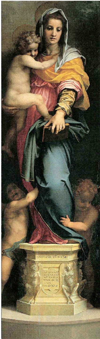
Madonna of the Harpies – Andrea del Sarto Uffize Gallery (Firenze)