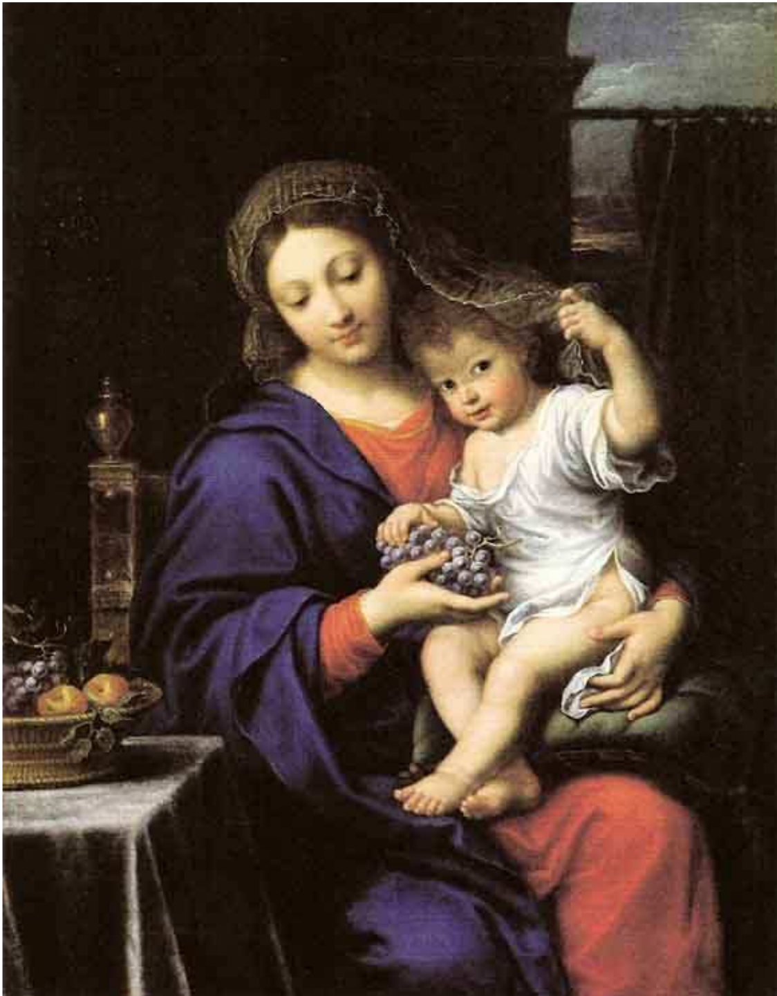
La Vierge a la grappe – Pierre Mignard. National Museum (Paris)