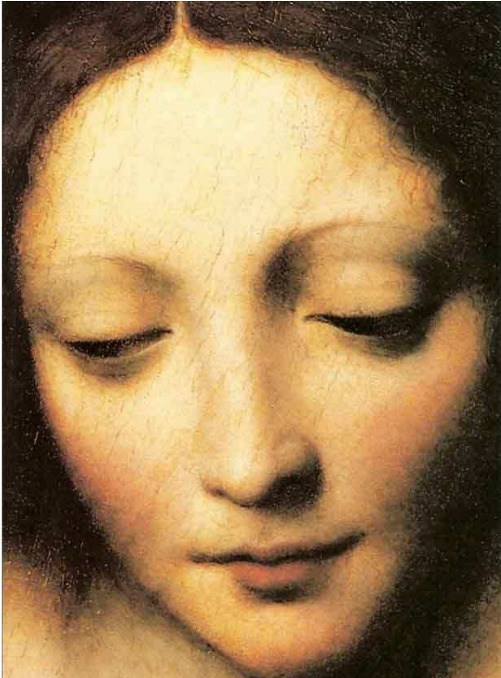
The Christ Child Asleep (detail) – Bernardino Luini. Louvre (Paris)