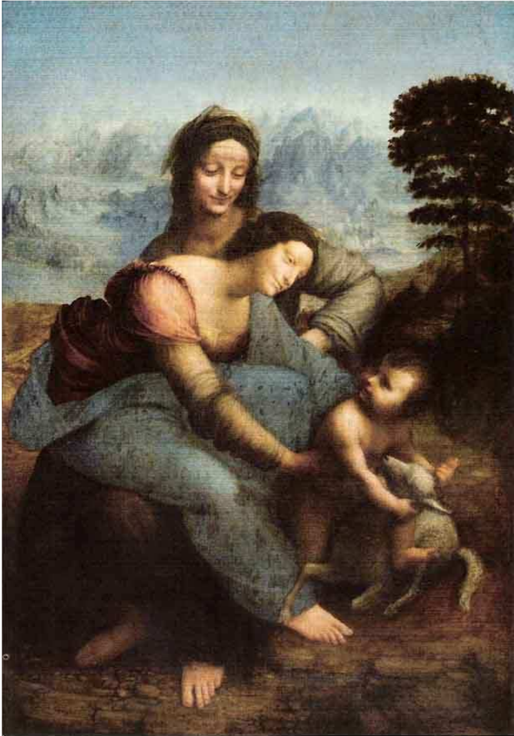
La Vierge à l'Enfant avec sainte Anne (detail) – Leonardo da Vinci. National Museum (Paris)